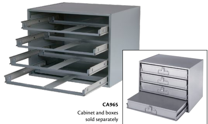
CA965 Cabinet and boxes sold separately