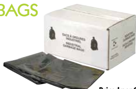
Priced per Case