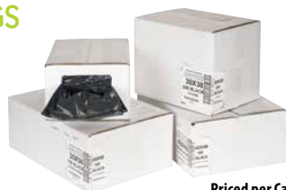
Priced per Case